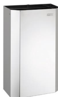
PPA4279C Bright finish