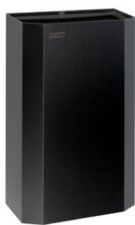
PPA4279B Matte black finish