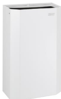
PPA4279 White finish