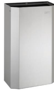
PPA4279CS Satin finish